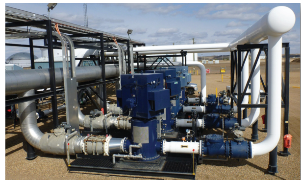
Figure 1 - Crude oil booster pump system

Grose continued, “AFT Impulse provided the flexibility to vary the induced transient flow profiles with many transient activation options. Without this functionality, modeling a system with as many important unknowns as this would not have been possible.”