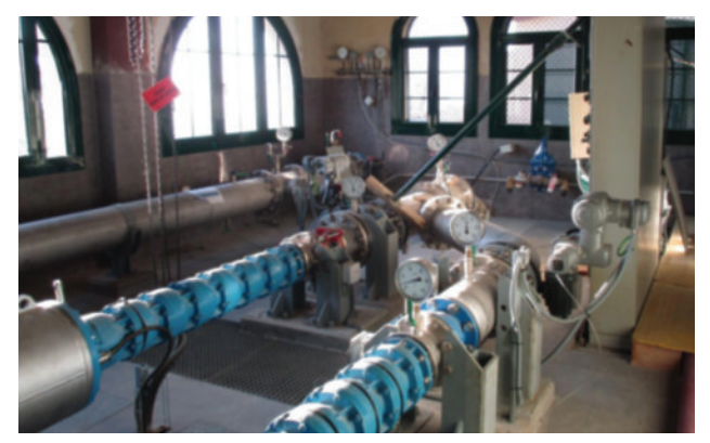
Figure 1 - Tibidabo Pumping Station

The correlation between the field data and AFT Impulse model for the nozzle check valve is almost perfect for both maximum and minimum pressure (Figure 2, second from the top).